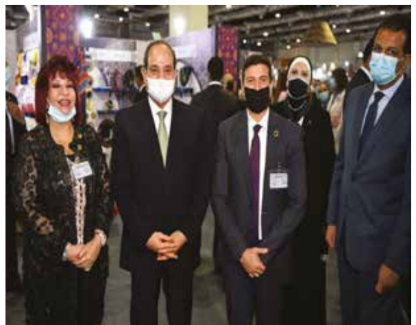
The Arab Women Investors Union pavilion at the "Turathna" Exhibition in the esteemed presence of His Excellency President Abdel Fattah el-Sisi, President of the Arab Republic of Egypt