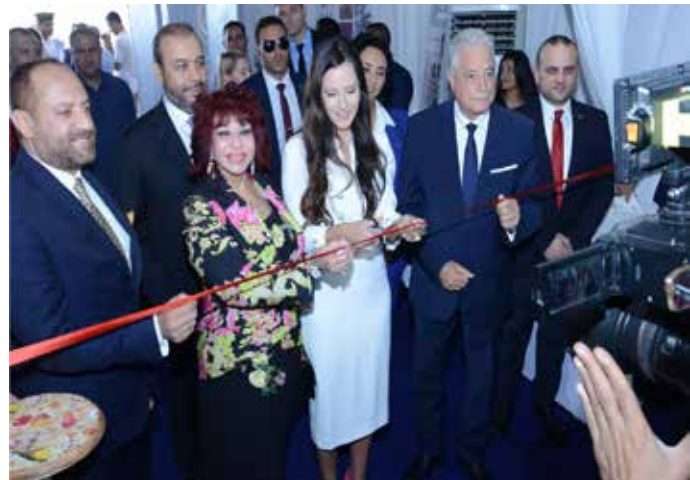
The official opening of the Arab-African Investment and International Cooperation Conference & Exhibition in Sharm ElSheikh - 2023