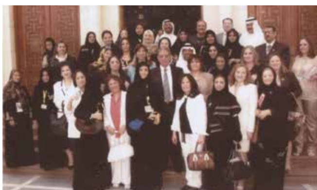
The Union and its members' meeting with His Excellency Mr. Amr Moussa, the Secretary-General of the Arab League - 2005