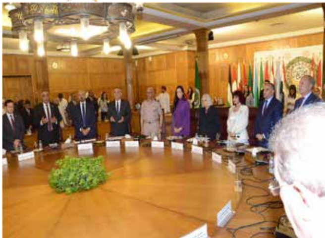
The official opening of the Arab-African Investment and International Cooperation conference at The Arab League Headquarters - 2023