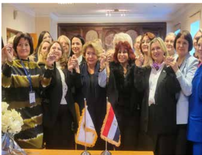
The celebration of Russian investors and businesswomen after signing the joint agreement with the Union.