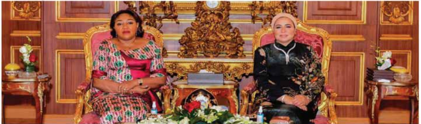
It was an honor that H.E. the First Lady of Egypt, Mrs. Entsar El Sisi

has received the Guest of Honor of the Arab African Investment and International Cooperation's conference in its 23rd version during the period from the 2nd of November till the 5th of November 2020