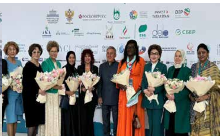
The meeting of His Excellency the president of Tatarstan with the distinguished women icons during the Russian Islamic world summit.