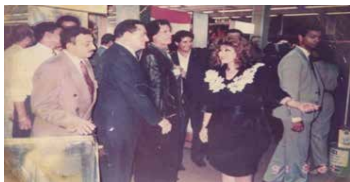
Participation in the Egyptian Industries Exhibition in the city of Benghazi, upon the invitation from the former President of the Arab Republic of Egypt, Hosny Mubarak, and the attendance of Colonel Muammar Gaddafi, the former President of the Libyan Arab Jamahiriya