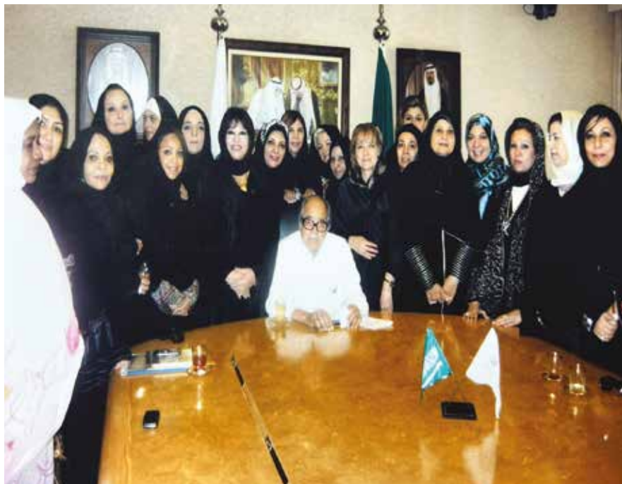
Reception of Sheikh Saleh Kamel Head of the Islamic Chamber of Commerce and Industry for Members Of Arab Women Investors Union