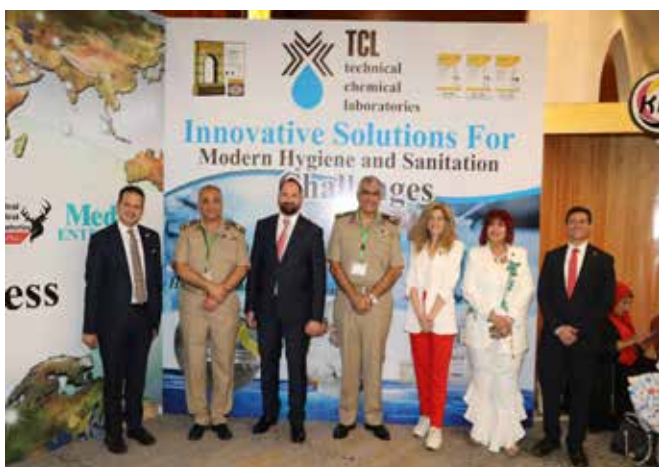
Leaders from the Egyptian Armed Forces visiting the booth of TCL Group, one of the companies within the Arab Women Investors Union