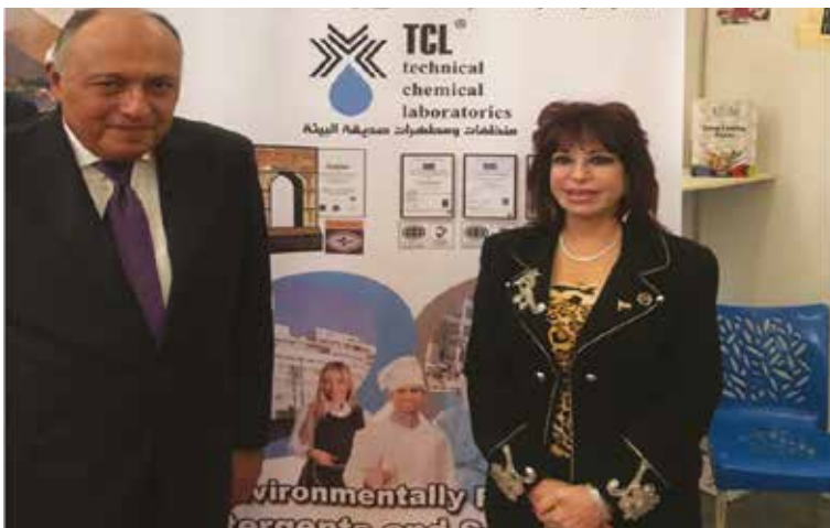
His Excellency Minister Sameh Shoukry, the Egyptian Minister of Foreign Affairs, supports an environmentally friendly industrial detergents and sanitizers factory