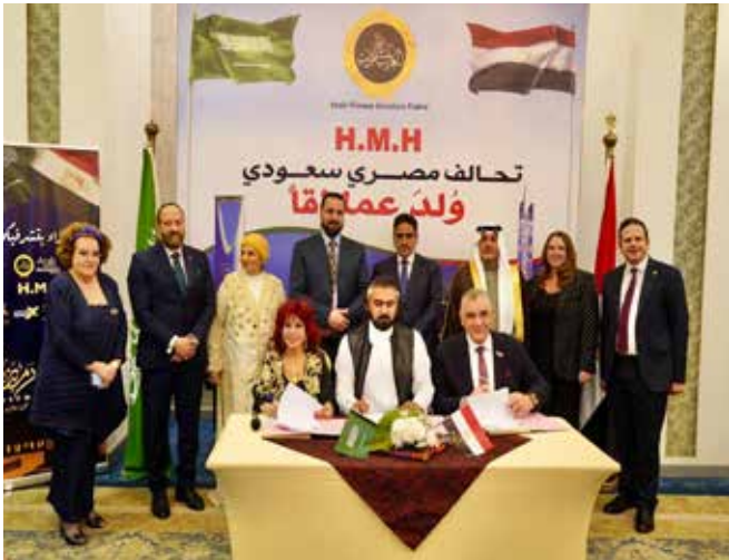
The signing of an Arab-Saudi agreement, and the establishment of a Join share holding company