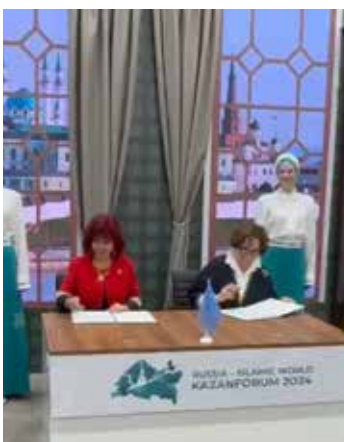
The signing of a cooperation protocol between the Arab women investors union and the Russian Women union during the Russian Islamic world summit.