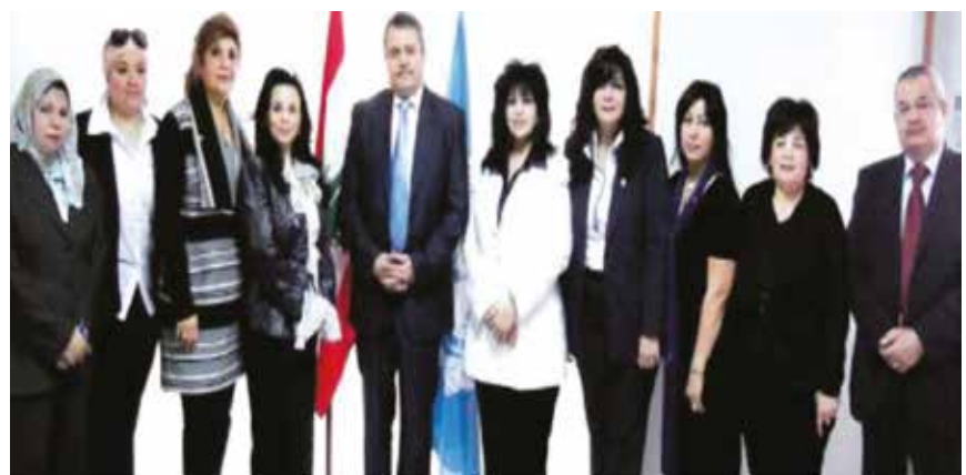
The Arab Women Investors Union meeting with the representative of the United Nations Food and Agriculture Organization (FAO) in Lebanon