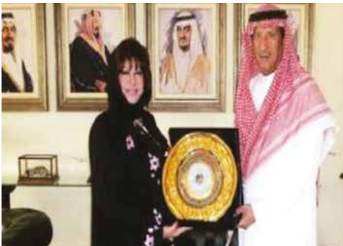
The "Towards a Green World" Competition sponsored by His Royal Highness Prince Turki bin Nasser, the President of the General Authority of Meteorology and Environmental Protection in the Kingdom of Saudi Arabia