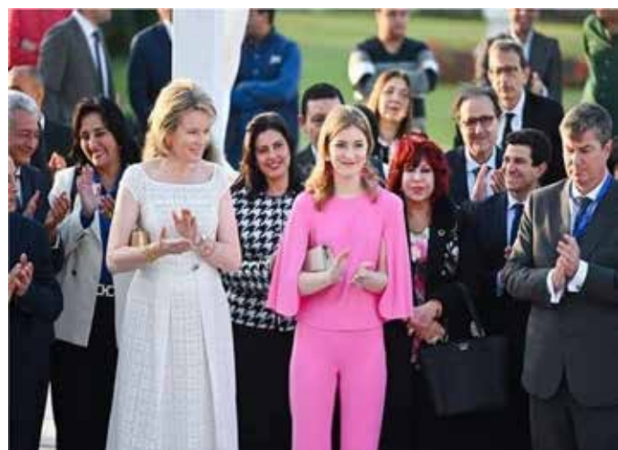
The President of the Union and the head of the Sustainable Development Committee, participating in the reception ceremony for Her Majesty Queen Mathilde and Her Royal Highness the Duchess of Brabant at the Baron Palace