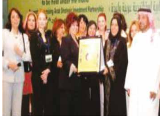
Conference: Towards a Promising Strategic Investment Partnership; Under the patronage of Her Highness Sheikha Fatma bint Mubarak, the first supporter and advocate of the Union since its inception