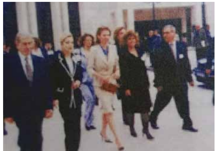
Participation of the Businesswomen Association for Development in the Women and Investment Conference in Syria, upon an official invitation from H.E. Mrs. Asma al-Assad, the First Lady of the Syrian Arab Republic