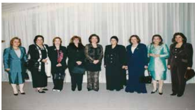
The Second Women's Conference in Amman, attended by Egypt's former First Lady Suzanne Mubarak, upon a special invitation from Her Majesty Queen Rania - 2003