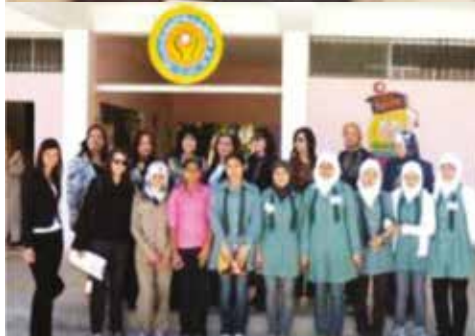
The participation of the Arab women Investors Union in Her Majesty Queen Rania's initiative - My Palestine school