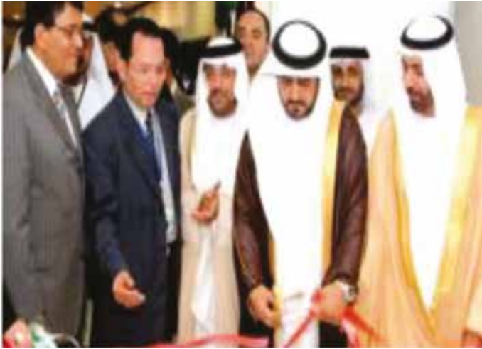
The opening of the conference: Towards a Strategic Investment Partnership; Attended by H.E. Minister Ahmed Juwaili and a select group of businessmen/Businesswomen