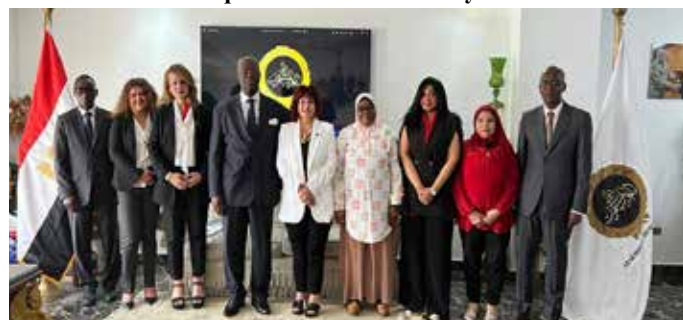
The Arab Women Investors Union welcomed H.E. the Ambassador of Côte d'Ivoire in Cairo, Amb. Timothy Izouon, and the Accompanying Delegation, to Discuss means of Strengthening Joint Trade and Cooperation between both countries.