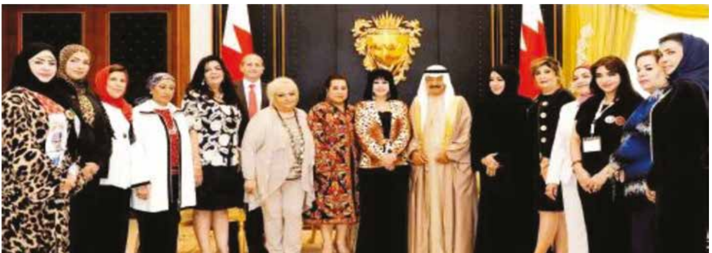
A meeting between Prince Khalifa bin Salman Al Khalifa, the Prime Minister of Bahrain, the Speaker of the House of Representatives, the Minister of Information, and a delegation from the Union led by Dr. Hoda Galal Yassa.