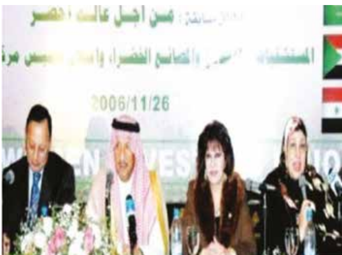
The "Towards a Green World" Competition sponsored by His Royal Highness Prince Turki bin Nasser, the President of the General Authority of Meteorology and Environmental Protection in the Kingdom of Saudi Arabia