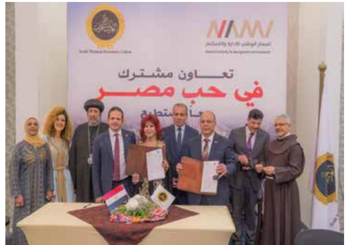
Cooperation agreement between the National authority of administration and investment and the Arab women investors union