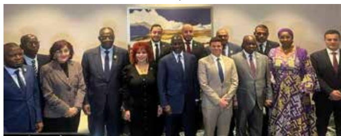
The Arab Women Investors Union was invited by H.E. Mr. Adama Bictogo, President of the Ivorian Parliament, H.E. Ambassador of Cote D'Ivoire to Egypt, and representatives from the Ivorian government for a collaborative meeting to discuss opportunities for joint cooperation and trade exchange.