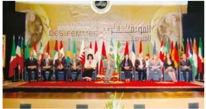
The International Conference for Arab women Investors Union in the Kingdom of Morocco under the patronage of His Majesty King Mohammed VI and under the presidency of Her Royal Highness Princess Lalla Hasnaa, His Majesty's sister