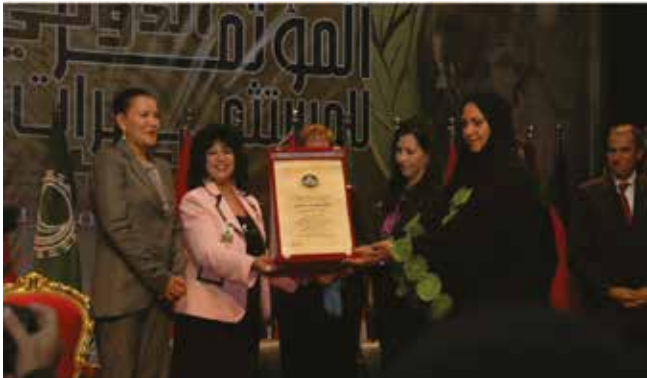
Her Royal Highness Princess Lalla Hasnaa receiving the shield of the Arab women Investors Union on behalf of His Majesty King Mohammed VI, King of the Kingdom of Morocco - 2009