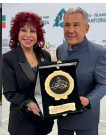
The Presentation of the AWIU Shield to H.E Rustam Minnikhanov the president of Tatarstan