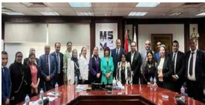
Signing of the Cooperation Agreement with the CEO of the Micro, Small and Medium Enterprises Development Agency in Egypt