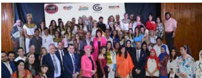
Premiere of a theatrical production showcasing the journey of the Holy Family between Egypt and Jordan, with the objective of fostering religious tourism between the two countries. The debut took place on the stage of the Franciscan Fathers at the Monastery of the Virgin Mary in Mokattam.