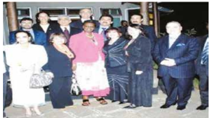
Cooperation protocol with the Republic of Uganda's First Lady, H.E. Janet Museveni, with members of the Arab Women Investors Union's attendance