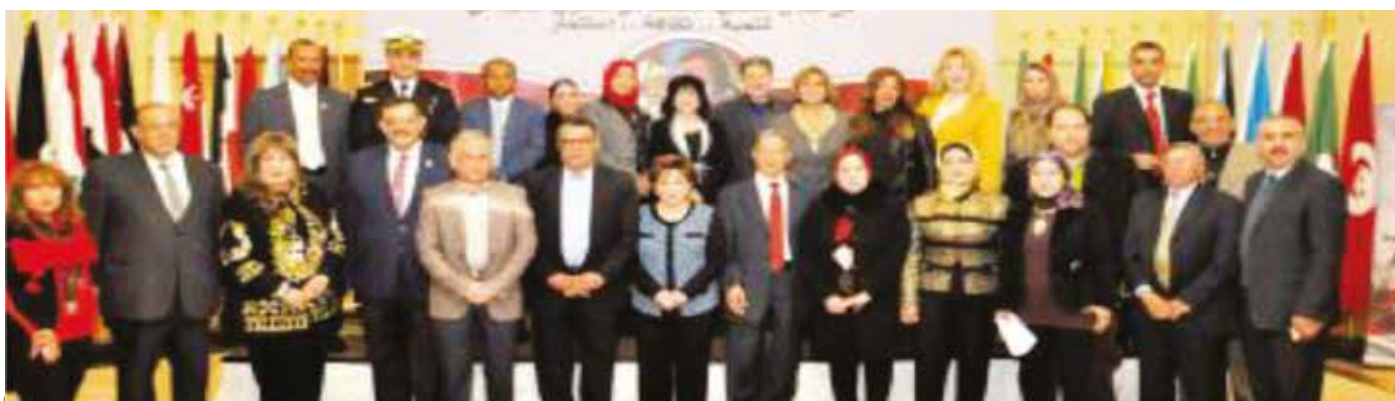
The Arab women Investors Union launched the "Arab-African" Initiative through the Egyptian-Sudanese Economic tie at the Masa Hotel, Cairo.