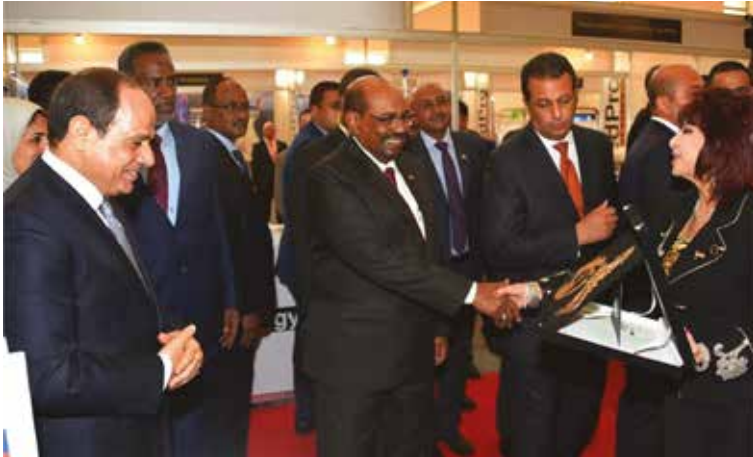
The support and endorsement of His Excellency President Abdel Fattah el-Sisi, President of the Arab Republic of Egypt, on the sidelines of the Egyptian-Sudanese Summit in Khartoum, at the Arab Women Investors Union pavilion.