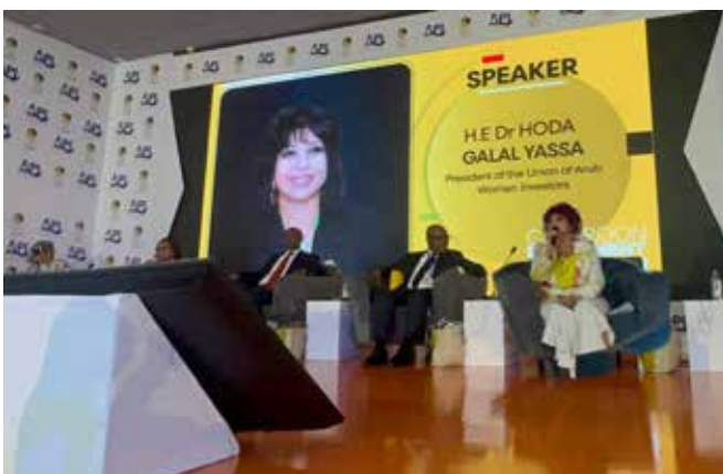
A presentation of the achievements of the Arab women investors union, and it's president's speech during the 4th session of the Investment Forum in Cameroon