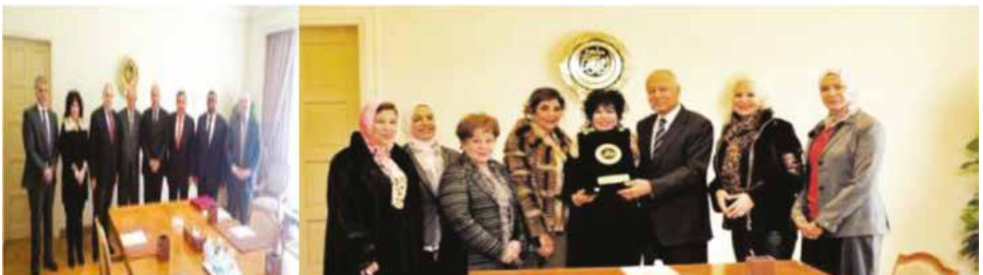
A meeting between the Secretary-General of the Arab League, Ahmed Aboul Gheit, and a delegation from the Union at the headquarters of the Arab League