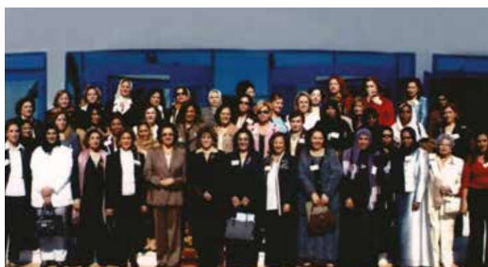
The female delegations from different Arab countries, honored by the presence of Egypt's former First Lady Suzanne Mubarak, at the Perspectives of Development and the Future of Joint Arab Investment Conference and Exhibition in Sharm El-Sheikh