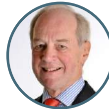
Lord Peter Lilley Member of the House of Lords, United Kingdom